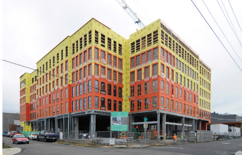
The L.L. Hawkins will contain five stories of wood-frame apartments over ground-floor retail and parking space. The project is targeting LEED Platinum.

The apartment building occupies the eastern portion of a block bounded by Northwest Raleigh and Quimby streets and 21st and 22nd avenues. An existing warehouse building on the block's western portion is being redeveloped for New Seasons Market , which is slated for a late summer opening. Work on the L.L. Hawkins will be complete by early fall.