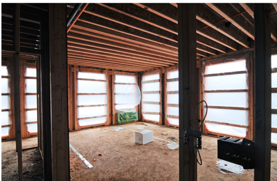
The building's 113 residential units will range in size from studios to two-bedrooms.