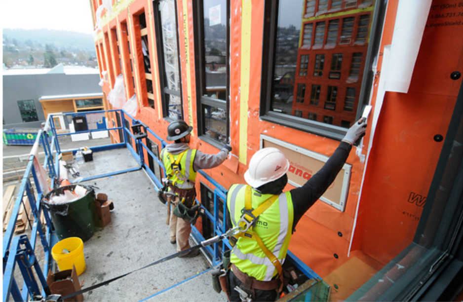
Crews with Primo Construction install windows on a third-story unit.