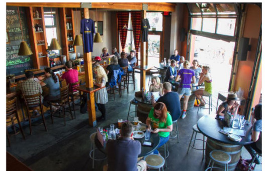
Breakside Brewery has seen astronomical growth in five years; their beer is available on draft and in 22-ounce bottles in Oregon, Seattle area, Denver, Hawaii and British Columbia. A new brewpub is set to open in Northwest Portland early next summer.